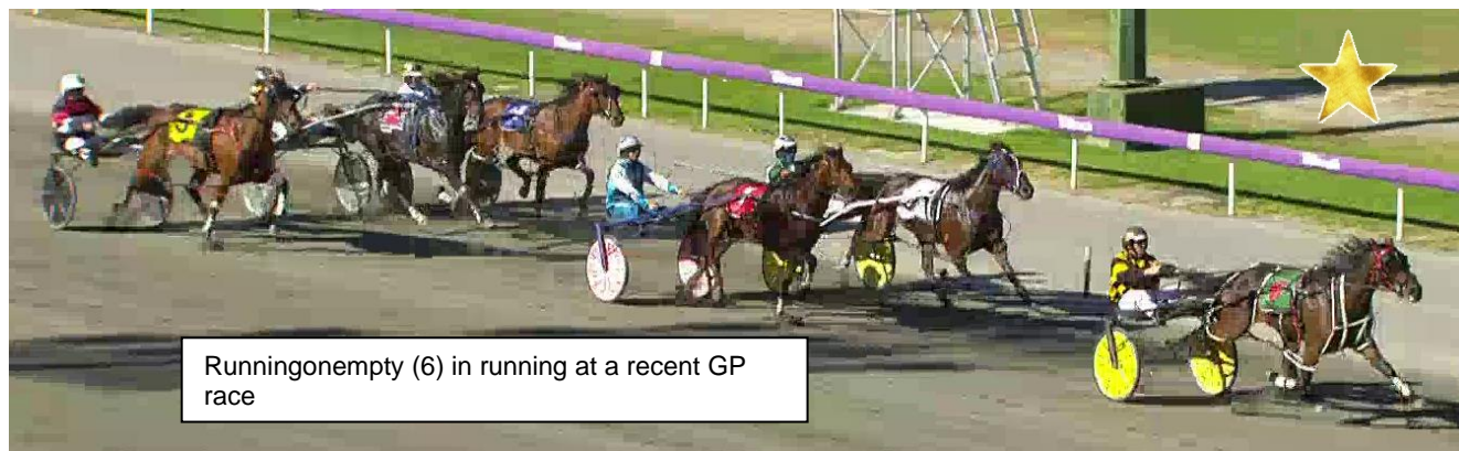
Runningonempty (6) in running at a recent GP race

Runningonempty is the 7 th foal and 5 th winner from his dam Starring Live NZ (Live Or Die USA) 2:01.4 5 wins $15,545, with her other winners including Adda Rising Star (Rich And Spoilt) 1:58.1 $184,608 and Rockinthebox (Pet Rock USA) 1:56 $85,297. Adda Rising Star is the dam of Group 1 winner Blue Chip Adda (Heston Blue Chip USA) 1:55 $102,357. This is a big family with many stars, but some of the very good winners with a local flavour include Famous Alchemist (Mach Three CA) 1:53 $322,869, Aliveandwell (Live Or Die USA) 1:50.4 $467,815, Group 1 winner Rich Yankee 1:57.6 $137,492, Can Return Fire (Courage Under Fire NZ) 1:53.9 $312,222 and the unlucky Gracias Para Nada (Mach Three CA) 1:56.3 $114,741